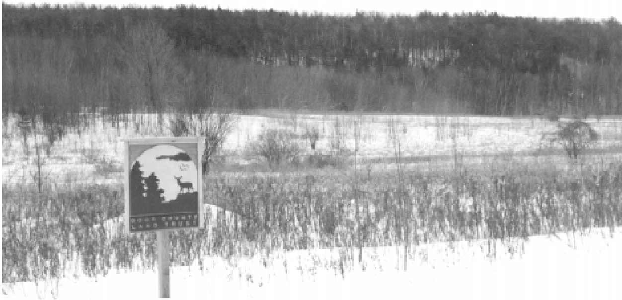
A winter view of Bay Shore Blufflands from about ½ mile south of the Carlsville Road-BSD intersection.