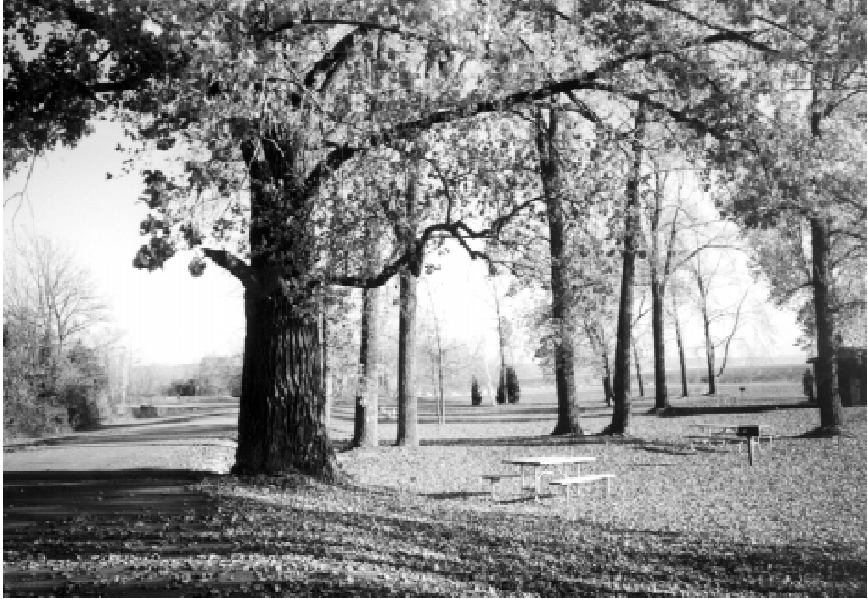
Better (at least warmer) days are coming. This is the view at Old Quarry park looking toward town.