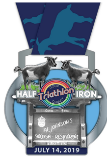
The 2019 Door County Half Iron medals honor Al Johnson's Swedish Restaurant

Each year the Door County Triathlon board of directors chooses a Door County landmark to honor. This year they are honoring Al Johnson's Swedish Restaurant & Butik in honor of their 70 th anniversary. Let's support the athletes with signage and cheer for them along Bay Shore Drive on the July 13 and 14!