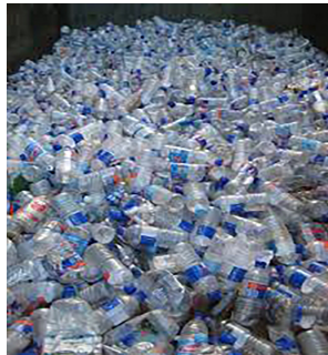
Plastic bottles pile up, even if recycled

Perhaps you are wondering – what’s the big deal and how does it apply to a retired BSPOA member? Let’s run the numbers. BSPOA has over 300 member households. If each household reduced their single use plastic bottle consumption, by only one, that is 300 per day. Over one year’s time (365 X 300) our members could reduce plastic pollution by 109,500 bottles. If you buy them by the case at ten cents each that is $10,000 dollars. Of course if you buy them at the convenience store, for one dollar each, it would be over $100,000 in savings.