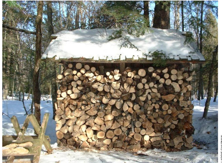
Carl's wood shelter