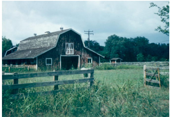
This barn may be on Maple Road.