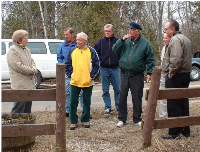
The GDA Board considers the fate of the Pebble Lane fence. It was removed.

The women's birthday luncheons are going to be a