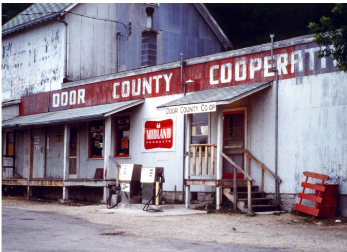
The Door County Coop on the West side of Sturgeon Bay.