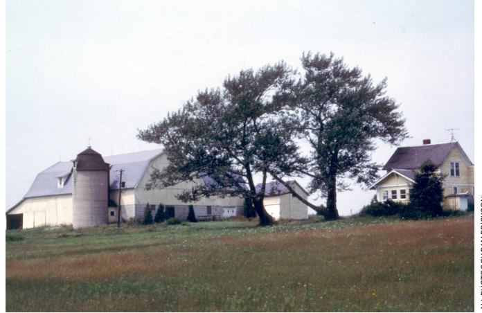
This barn is on County T (north), near Bechtel Road. It was recently painted bright yellow.