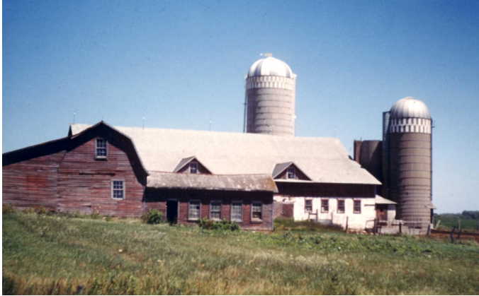
Anyone know where this barn is?