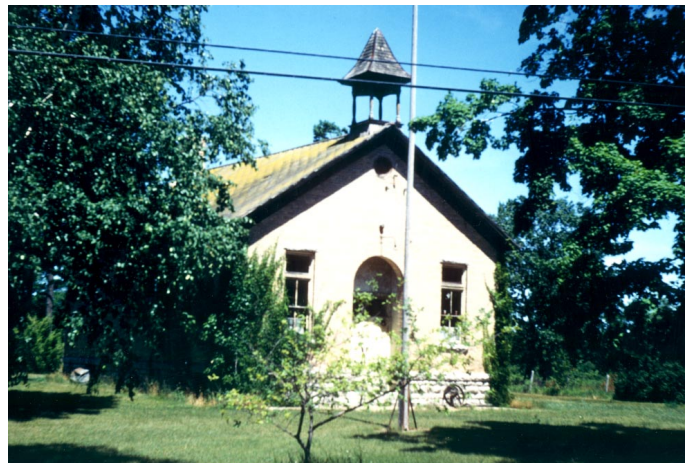
This structure is on County TT and is now a residence for a landscape company.