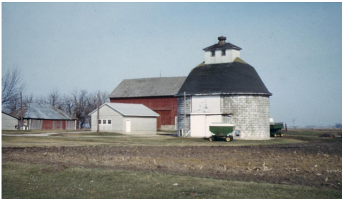
A round barn somewhere in Door County.