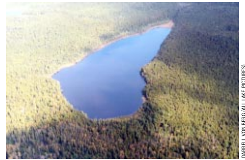
DARRELL VON BERG (ALL LAKE PICTURES)