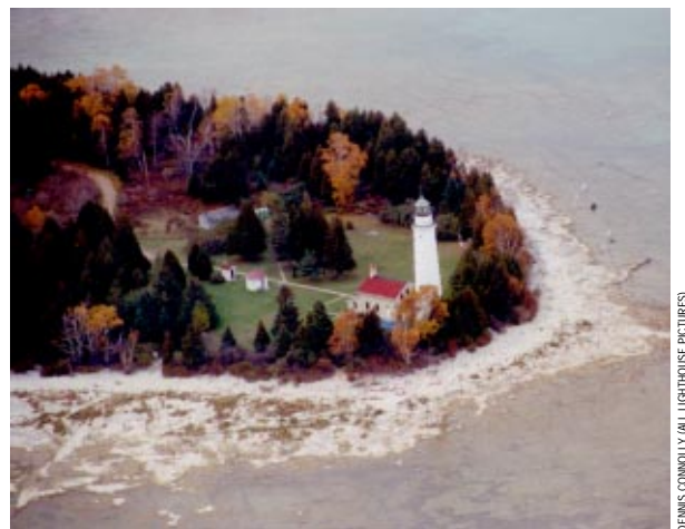
DENNIS CONNOLLY (ALL LIGHTHOUSE PICTURES)