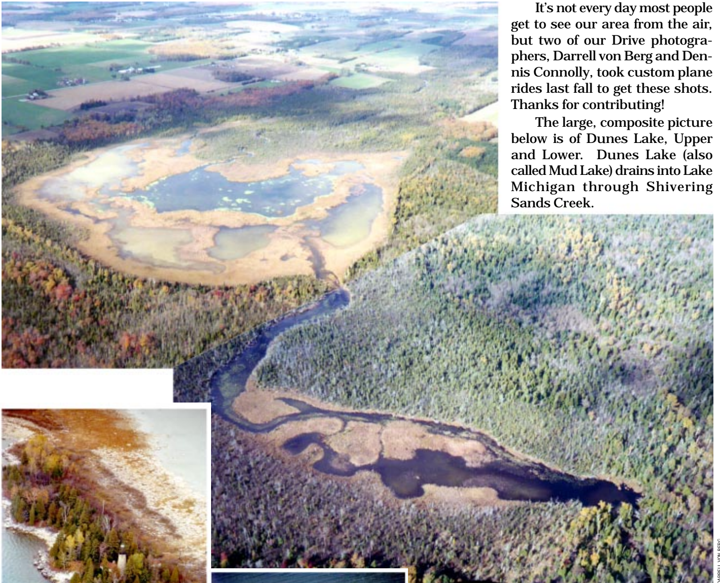
DARRELL VON BERG

The large, composite picture below is of Dunes Lake, Upper and Lower. Dunes Lake (also called Mud Lake) drains into Lake Michigan through Shivering Sands Creek.