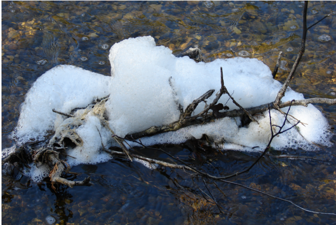
Foam on Shivering Sands Creek

County Land Trust is a local, nonprofit organization dedicated to preserving Door County's open spaces and wild places. Since 1986, the Door County Land Trust has permanently protected over 6,000 acres throughout Door County. Visit the Land Trust's website to find out more about the Land Trust and for maps and directions to Land Trust nature preserves.