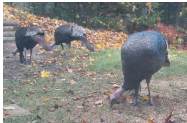
These turkeys escaped the Thanksgiving table and are frequently seen in yards this time of year.