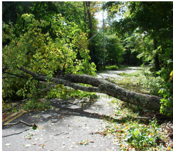
Downed trees like this one blocked the exit from the Drive at the north end.

Such is the hazard of living where nature knows best.