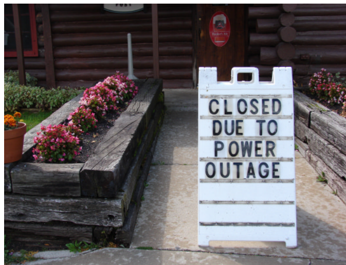
The Hitching Post was affected like everyone else.